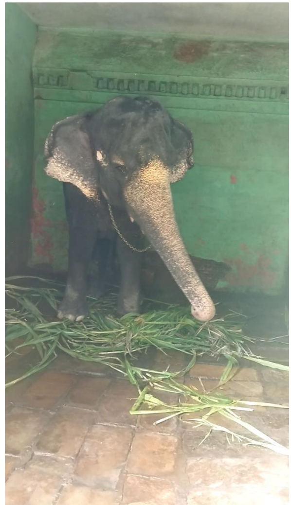
Head bobbing and swaying, a sign of psychological distress.