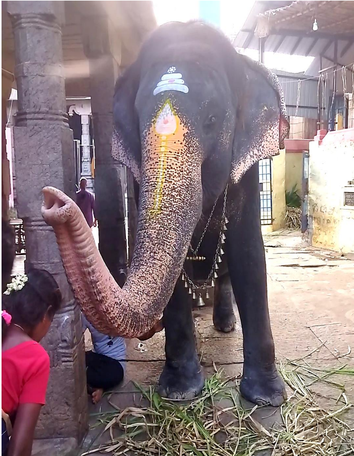
Deformed nails. Despite her poor health condition, she is forced to stand on the stone floor and bless devotees for earning money for the mahout