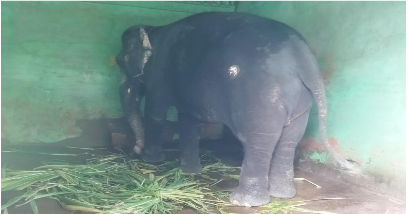
No drinking water trough. Holding chain with trunk and banging on the floor constantly