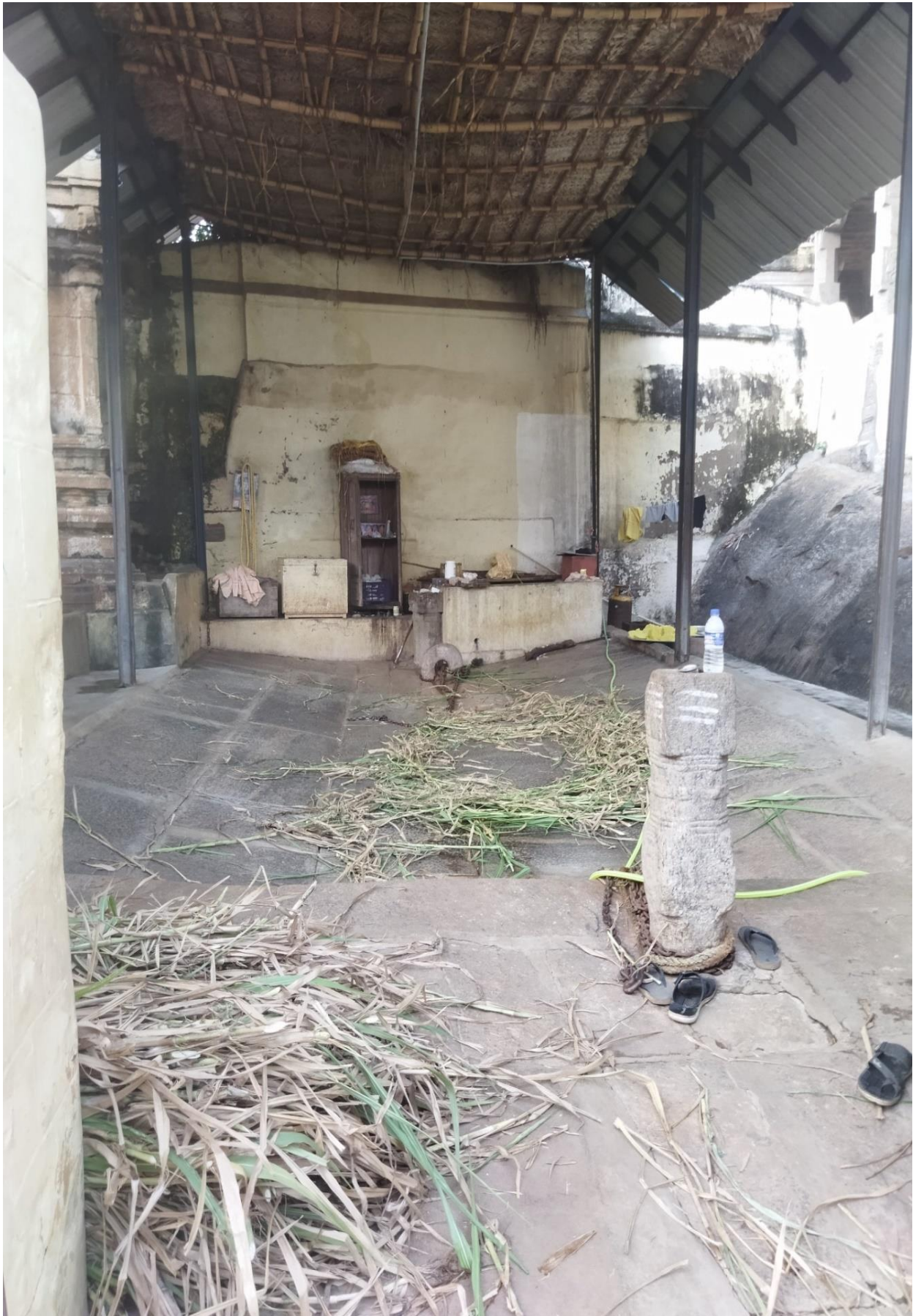
Shed with an unsuitable stone floor and two side inclinations, making it hard to stand straight