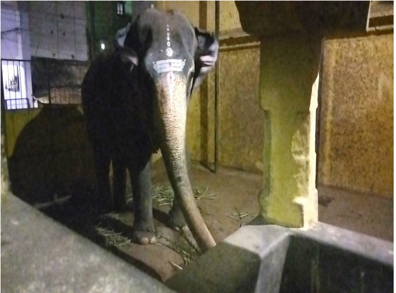
No water in the drinking water trough. Front 2 legs and back 1 leg chained.