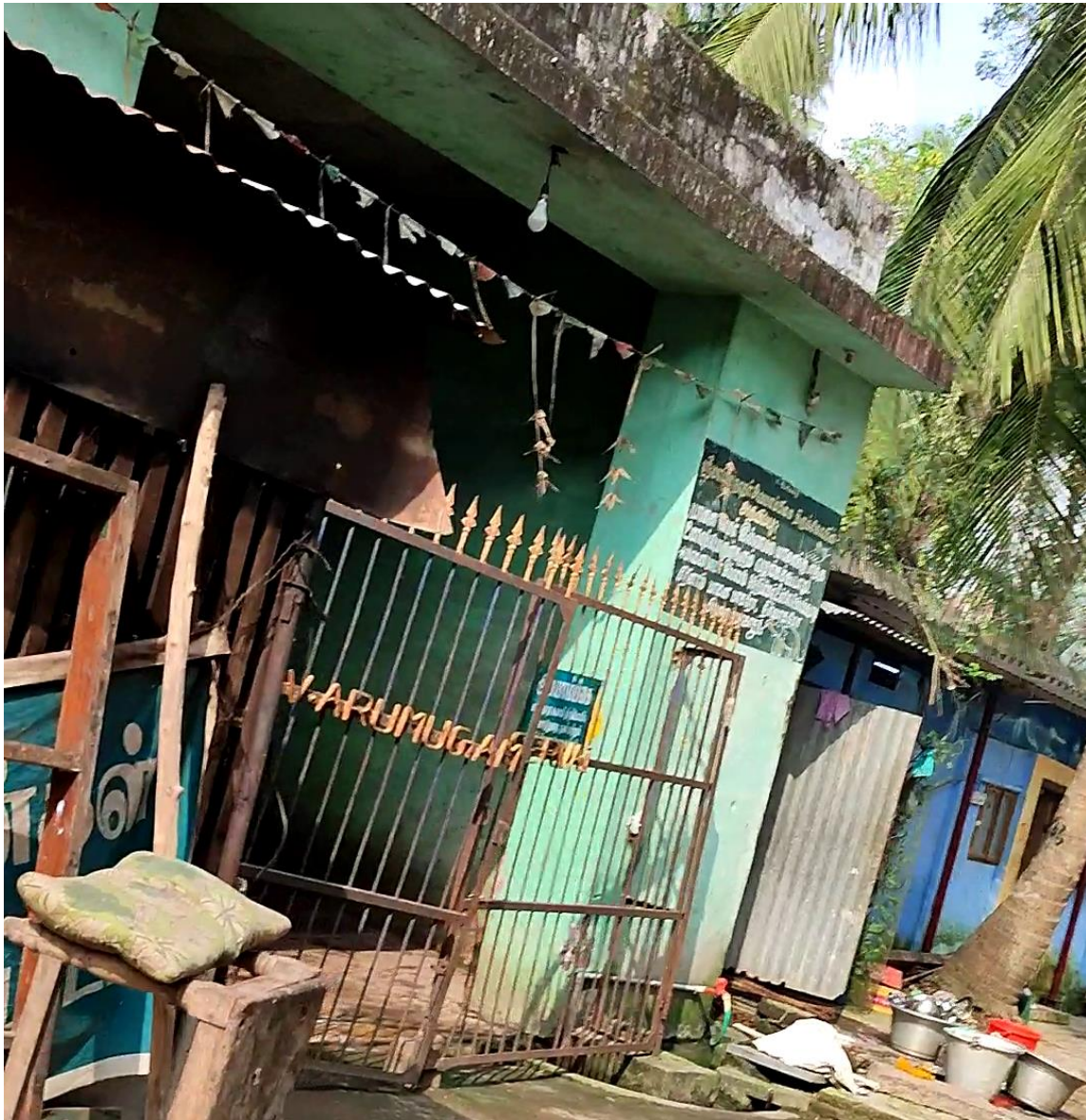
Small shed with stone floor and concrete roof