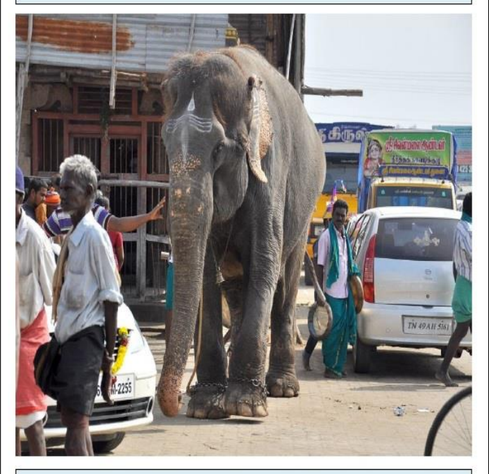
Living Conditions of Private Elephants (At temples & with private individuals) Solution to the problems