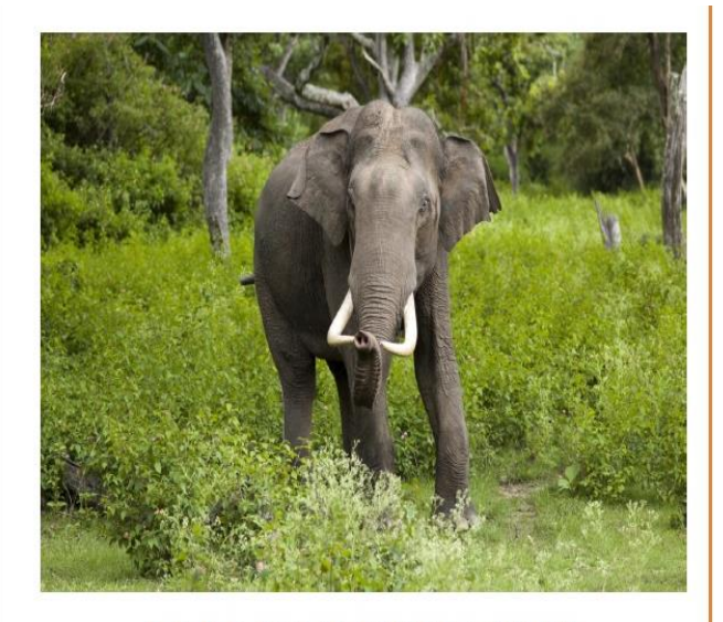
MALE ELEPHANTS TRANSLOCATION CASE STUDIES AND RECOMMENDATIONS