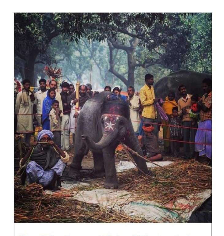
Illegal Capture and Sale of Elephants from North-East India to South India Media Articles and Research Reports